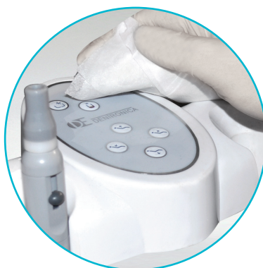
Clean the plastic carter of dental unit