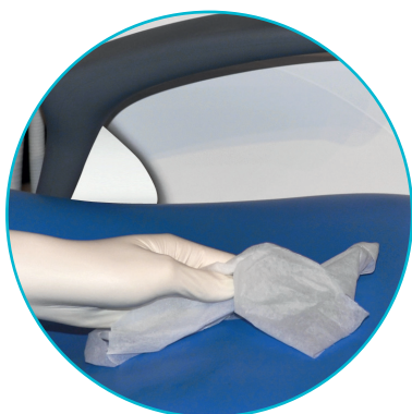
Clean the sky parts of dental unit