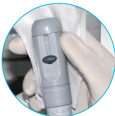
Clean the suction cannulas in plastic