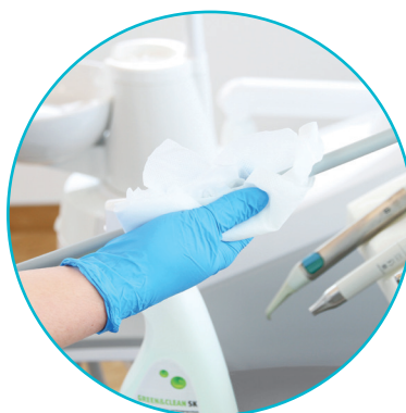
Clean the suction pipes and the instrument cords