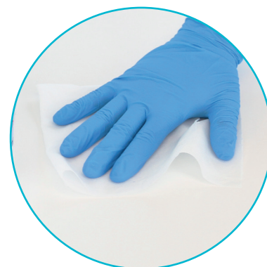
Clean all surfaces