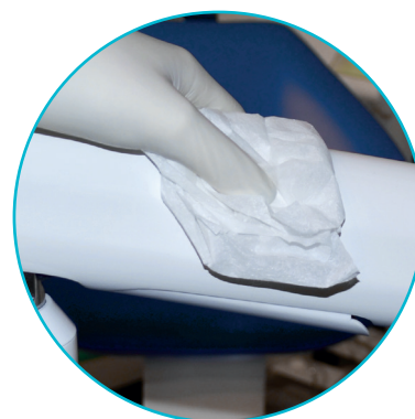
Clean arms, poles and handles